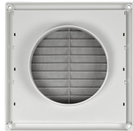
HGV - Back