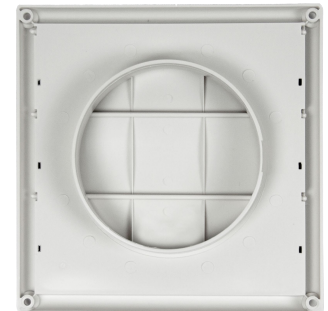
MV200 - Front