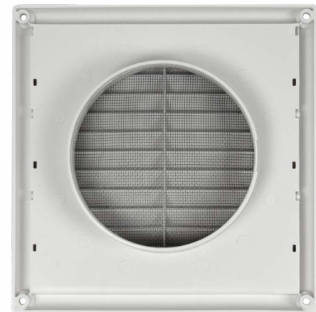
HGV - Back